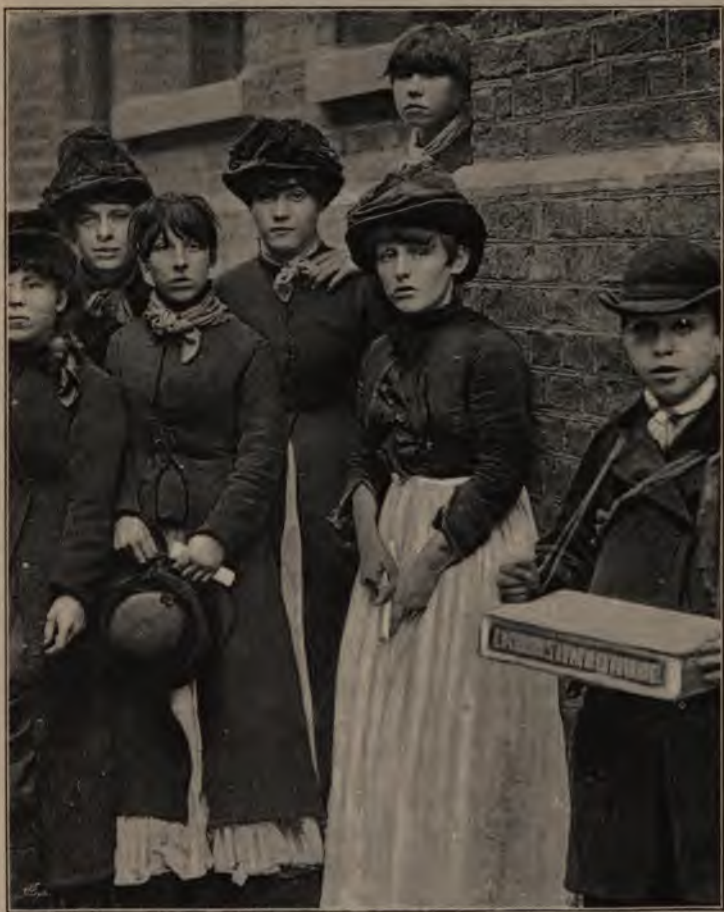
MEMBERS OF THE MATCHMAKERS' UNION.